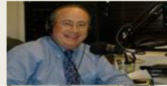
Tune in to Walt of Priebe

https://www.aarp.org/health/drugs-supplements/info-2019/preventive-aspirin-recommendations.html?intcmp=AE-HP-LL1